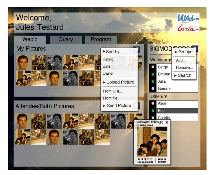
Figure 1: A screenshot of the Wepic user interface.

We now illustrate how some of these units of functionality are implemented with WebdamLog rules. To view pictures uploaded by a particular SIGMOD attendee, we use a relation selectedAttendees that contains one fact for each currently highlighted attendee (see right-hand side column in Figure 1). We also use a derived relation pictures, which is the view of all the pictures of a particular attendee. To obtain the pictures of all selected attendees, we use the rule: